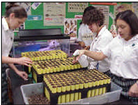
High school students in nine coastal parishes have established “Coastal Roots” seedling nursery programs in which black mangrove, wax myrtle, and bald cypress seedlings are grown for coastal restoration projects.