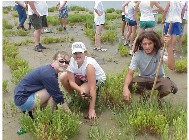
Coastal Roots nurseries provided seedlings for the vegetative restoration project at four separate Marsh Maneuvers camps held this summer on Grand Terre Island.

Just 2 years after getting started, Coastal Roots nurseries have already been able to lend a helping hand to another student-based stewardship initiative. Students attending the Marsh Maneuvers Coastal Education Program this summer on Grande Terre Island were faced with a shortage of native seedlings for their vegetative restoration project. Two Coastal Roots nurseries, the Larose-Cutoff Junior High and Central Lafourche High School, provided numerous wax myrtle and black mangrove seedlings for the Marsh Maneuvers campers to plant. The interaction of Coastal Roots and Marsh Maneuvers is a positive example of how the environmental stewardship initiatives can work collaboratively towards common goals. Congratulations to the Coastal Roots team of staff and students for their hard work and concern for coastal Louisiana.