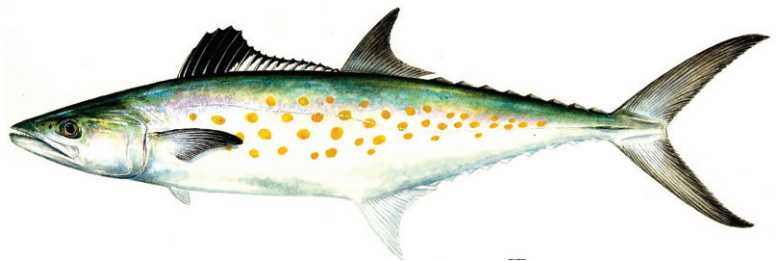
Spanish mackerel. Illustration credit: Diane Rome Peebles

The daily vessel trip limit for commercial vessels fishing for Atlantic group Spanish mackerel in federal waters of the southern zone is adjusted to 1,500 pounds, effective 6 a.m. local time, Feb. 22, 2011. The southern zone extends from 30°42'45.6" N. latitude (a line directly east from the Georgia/Florida boundary) to 25°20.4' N. latitude (a line directly east from the Miami-Dade/Monroe County, Florida, boundary).