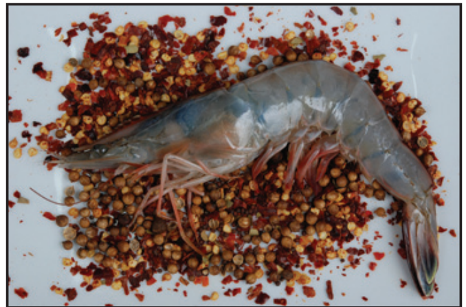
Louisiana Shrimp.

The LSU AgCenter has announced the availability of training workshops for shrimp fishermen enrolled in the Trade Adjustment Assistance program. The Trade Adjustment Assistance program provides technical training and financial assistance to producers who have been negatively impacted by imports. To be eligible, shrimp fishermen had to have applied for the program through their local Farm Service Agency office during one of two available signup periods. The first signup period ended on Sept. 23, 2010, and the second signup period ended on Dec. 23, 2010.