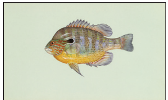
Longear Sunfish

Longear (long ear) Sunfish – ( Lepomis megalotis ): Often mistakenly known as pumpkinseed sunfish (true pumpkinseed sunfish, Lepomis gibbosus , have a northern range and are not actually found in Louisiana), these are deep-bodied, brightly colored sunfish with an extremely long opercular flap in adults. The back is brown to olive green. Scales on the sides have brownish spots that result in a brown background overlain with bright blue spots. Colors become much more intense in breeding males, which also have blue to charcoal-colored pelvic fins and bright orange to red sides and belly. The head in breeding males is orange or red with bright blue stripes; the stripes extend onto the body in back of the head, but not onto the throat region. The U.S. angling record of 0.8 kg (1.75 lb) was caught in New Mexico in 1985. The longear sunfish is a popular sportfish of stream anglers, although it is generally smaller than bluegill. It is caught on a variety of baits and will readily rise to small poppers (white or yellow imitations are often effective).