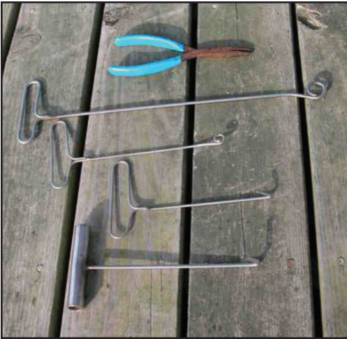
Dehookers