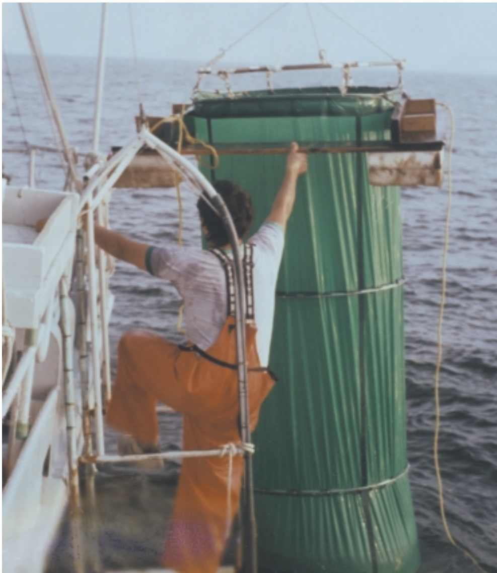
A researcher checks equipment used in a study of microscopic animals and plants in the Gulf of Mexico.

from the sea floor and in the water column. Individuals that fail to find sufficient food starve and die. But foraging skill isn't enough.