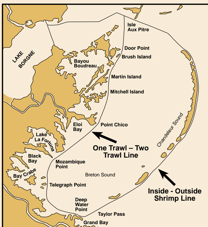
*One trawl - two trawl line.

*The maps in this brochure are approximate and are NOT to be used for navigation. For the exact boundaries contact the Department of Wildlife & Fisheries.